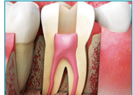
Filling the root canals